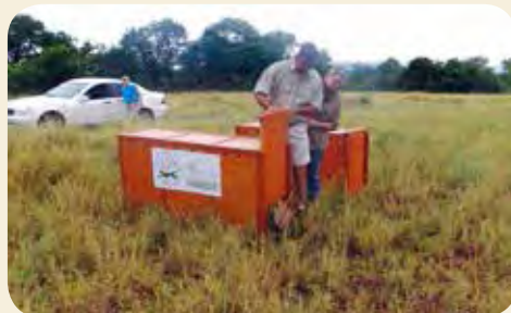
Opening the crate...