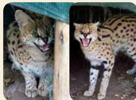
Muhle showing that she is ready for release!