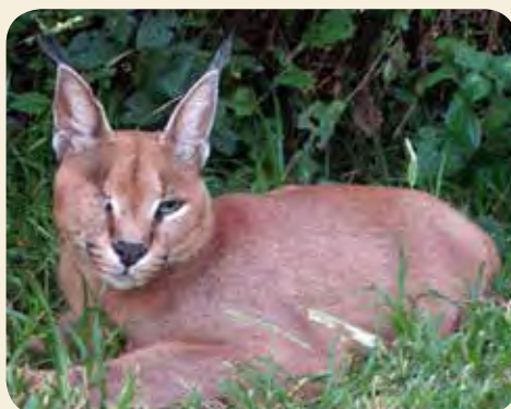
Popeye giving us 'the look!'

Peaches is still the naughty cat - stalking the zebra and everything that moves outside the fence. He shows us how well