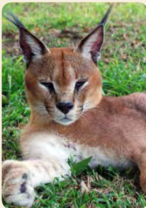
Max shows off his large paws