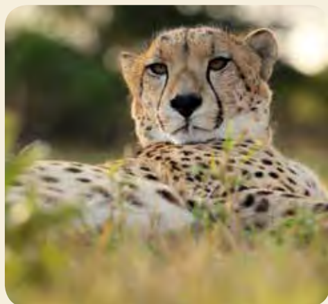
Moya relaxing in the sun.