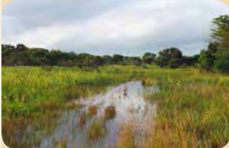
Below: The good rains have allowed these huge tadpoles to grow in the pools of water.