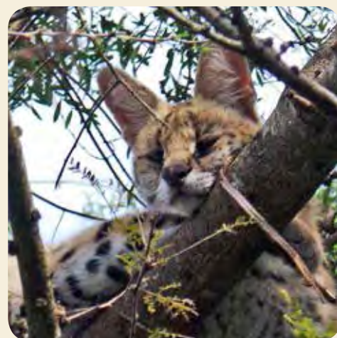
Spotty showing us her agility in the tree