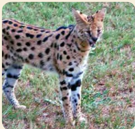
Noah looking to see where the food is