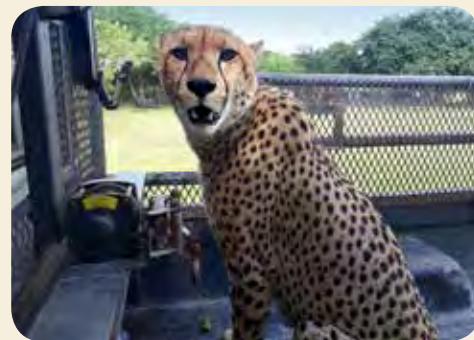
Juba and Moya still love riding on the back of the farm bakkie, as they did when young.

This all left Emdoneni with a substantial vet bill, which thankfully we are able to pay due to continued support from the public through the day visits.