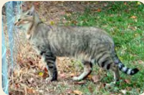
Houdini planning her next great escape