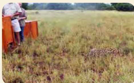
The dash to freedom in the wild.