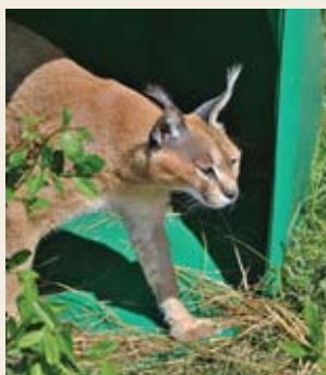
MAX with his new igloo.

We have received one new female kitten, which will be put into the breeding programme. We have to hand rear this cat, and therefore it makes it difficult to introduce it back into its natural environment. Neethlingshof Winery have adopted our caracal kitten, and we are waiting on her new name.