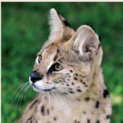
The one new Serval, who is waiting to be named.

LORKEN is loving his new home, he has his ball and there are always loads of guest talking to him while they wait for the show to start.