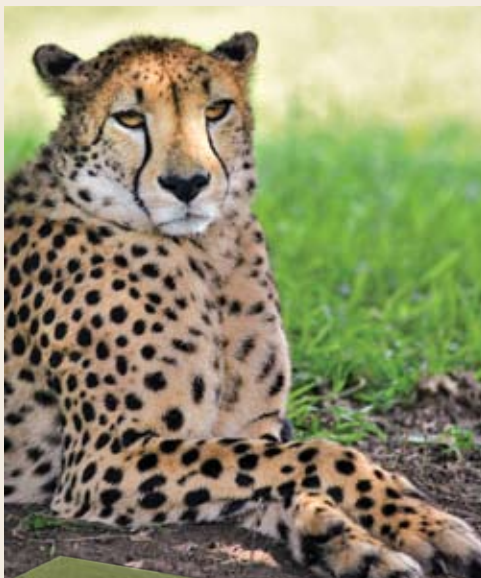
Autumn was a real lady with excellent table manners, until she met the Boys...

GIVE THE GIFT OF GIVING Adopt a Cat in your name or in the name of a loved one and help us save these magnificent endangered creatures. Contact details below, or visit website.