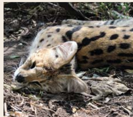
Just chilling out...